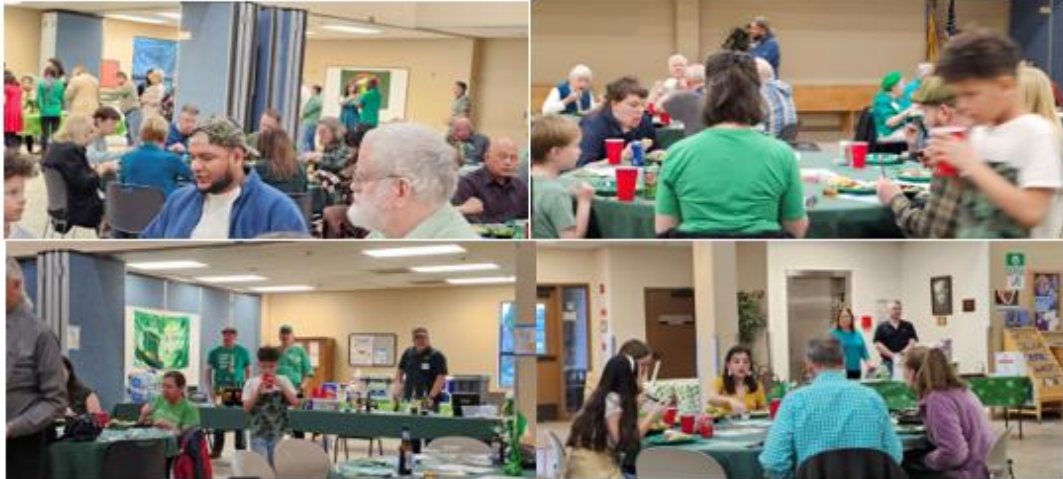
Serving area and singing of Irish Ballads

St. Pat's Dinner Was attended by 109 on Saturday, 16 March at Hallen Hall